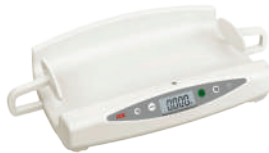
BABY HEIGHT & WEIGHT SCALE