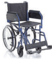
MANUAL WHEEL CHAIR