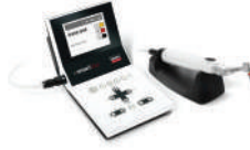
ENDO MOTOR & APEX LOCATOR