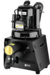
DENTAL SUCTION MACHINE