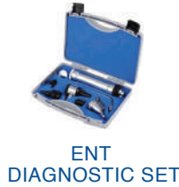
ENT DIAGNOSTIC SET