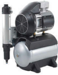
DENTAL AIR COMPRESSOR