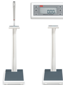
HEIGHT & WEIGHT SCALE