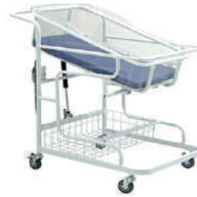
NEW BORN BABY BED