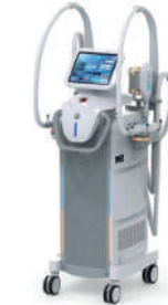
CRYOPOLYSIS FAT FREEZING MACHINE