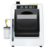
HANDPIECE LUBRICATING MACHINE