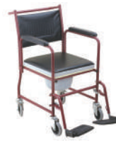
COMMODO WHEEL CHAIR