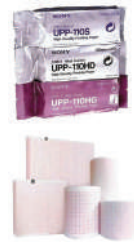
MEDICAL RECORDING PAPERS