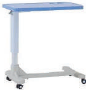
OVER BED TABLE