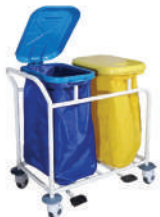
DIRTY LINEN TROLLEY