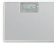
MECHANICAL & DIGITAL FLOOR SCALE