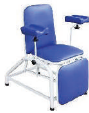
BLOOD DONATION CHAIR