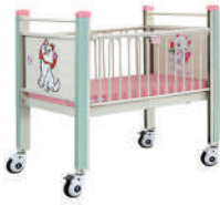
FLAT PAEDIATRIC BED