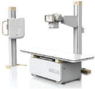
CONVENTIONAL X-RAY MACHINE