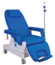
ELECTRIC DIALYSIS CHAIR