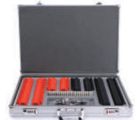
TRIAL LENS SET