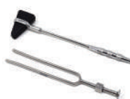
KNEE HAMMER & TUNING FORK