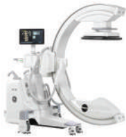
C - ARM